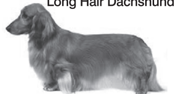
Long Hair Dachshund